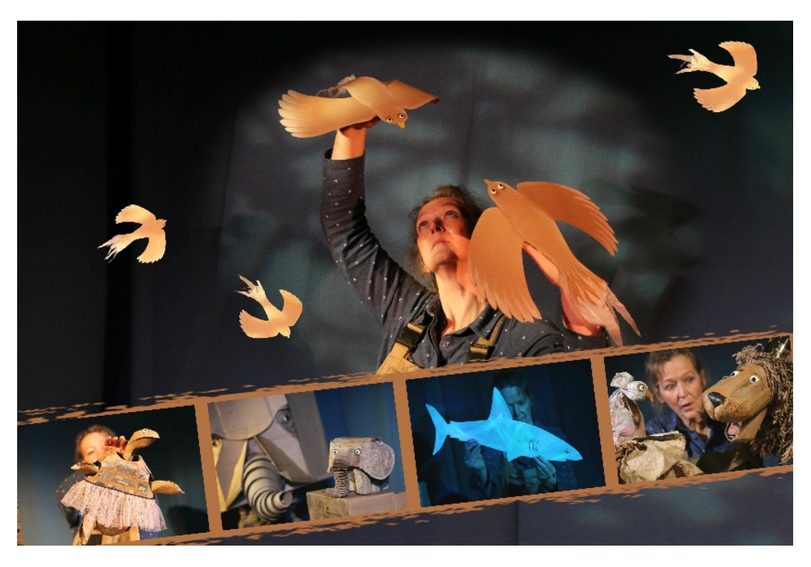
Trunk, Tail, Ears or Wings? - Carnival creates itself from all sorts of things!

This is "Carnival of the Animals" but not as we know it. Dissected for body part potential to create the "ultimate animal" we take inspiration from the music by Camille Saint-Saëns, a little help from Charles Darwin and a whole lot of cardboard to mash up a show full of puppet possibility.